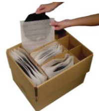
*Note: Push cell ends sideways to fit larger items.