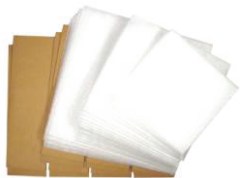
Dish Set pieces: cardboard cells, and foam pouches.